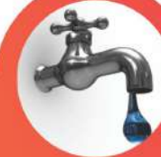
Potable Drinking Water