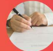
Clear Titled Document