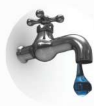
Potable Drinking Water