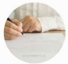
Clear Titled Document